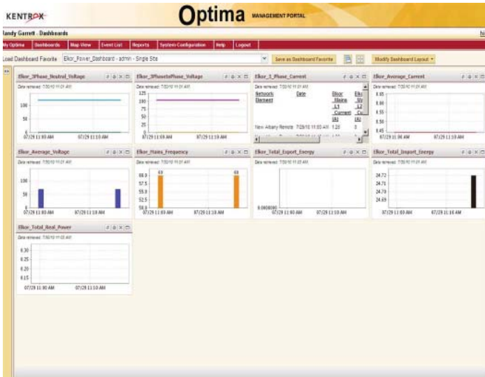
Three phase AC input displaying voltage, current, frequency, and energy consumed

These measurements can be collected, graphed, and analyzed within Optima. For example, actual kWh usage can be graphed over a given time period, such as a 30 day billing cycle, in an automated report and then sent to the relevant personnel for analysis.